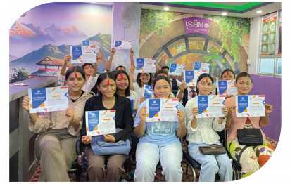
Skill Development & Livelihood Program