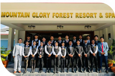
Mountain Glory Forest Resort & Spa Visit