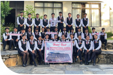
Visit to Siddhartha Vilasa