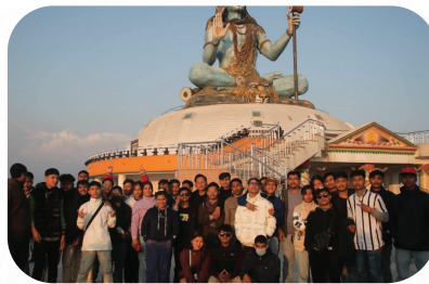
Pokhara Pumdikot visit