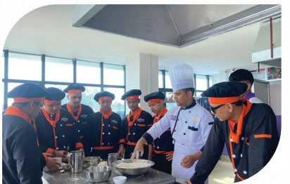
Special bakery classes