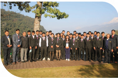
Ghale gaun/Fistail Lodge visit