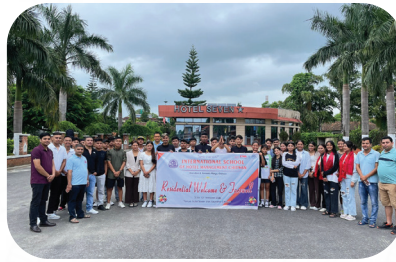
Welcome and Farewell Program