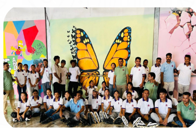
Skate Park Hakimchowk